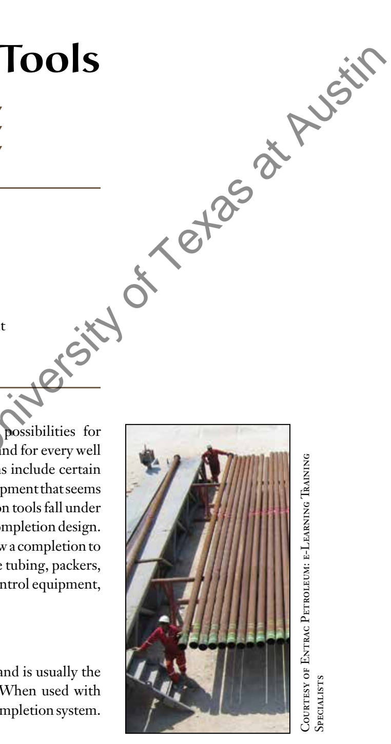
Figure 26. Tubing ready to be run into a well

Every type of tubing is assigned American Petroleum Institute (API) ratings for tensile, collapse, and burst strength. Tensile strength is the maximum pull that the tubing can bear from its own weight, plus any added pull required to unseat packers or anchors. If the pull is too great, the tubing will stretch until it parts. Collapse strength is the maximum